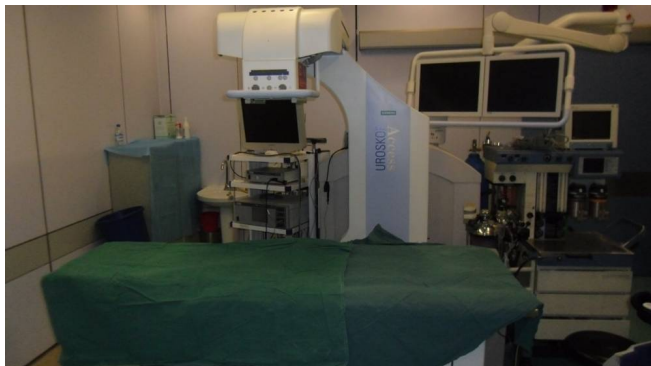
Figure 2. UROSCOP Access.

Operation time was defined as the time from ureteral catheterization to the placement of the nephrostomy tube. A stone-free state was defined as no residual stones of diameter >4 mm. Patients with residual fragments of diameter >5 mm were treated with extracorporeal shock wave lithotripsy (ESWL) or second phase PCNL. Postoperative complications were classified according to the modified Clavien grading system. 15