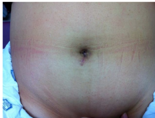
Fig 4. Postoperative photograph of umbilical incision site taken at postoperative day 28.

Similarly, no significant differences were observed between the two groups in regards to the duration of operation, the number of patients requiring blood transfusion or the amount of blood transfused per patient, the incidence of bowel injury, rates of postoperative fever, the number of wound infection, and the duration of hospital stay. No complications, including wound-related problems, were observed at postoperative follow-up (Fig. 4).