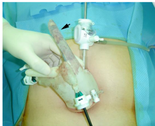
Fig 2. Removal of the specimen. The specimen was extracted into a fingertip of a surgical glove. Arrows indicate the removed specimens.