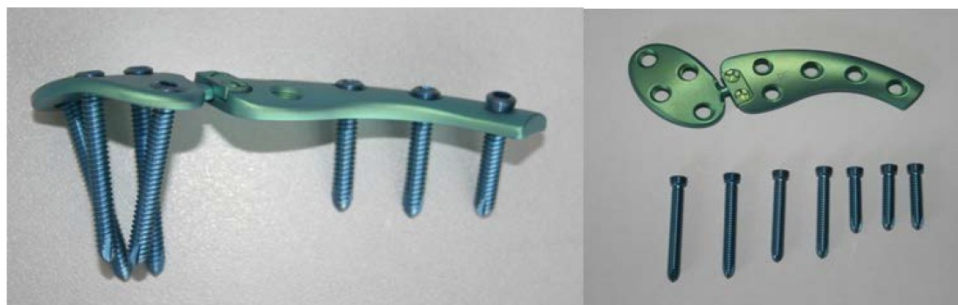
Figure 1. The appearance of micro-movable and anatomical acromioclavicular plate (MAAP).

Radiographic evaluations were routinely conducted every 3 weeks until 3 months postoperatively. We use the method which has been described by Pavlik by evaluating the vertical distance between the inferior border of the acromion and the clavicle in comparison with the contralateral side and measured the differences in millimeters (less than 2 mm, anatomical reposition; 2-4 mm, slight loss of reduction; 4-8 mm, partial loss of reduction; greater than 8 mm, total loss of reduction) [3] . Degenerative changes of the acromioclavicular joint was also reviewed and recorded.